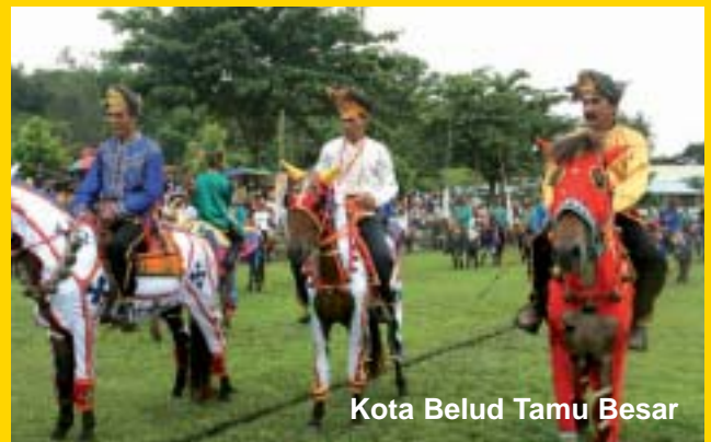
Kota Belud Tamu Besar