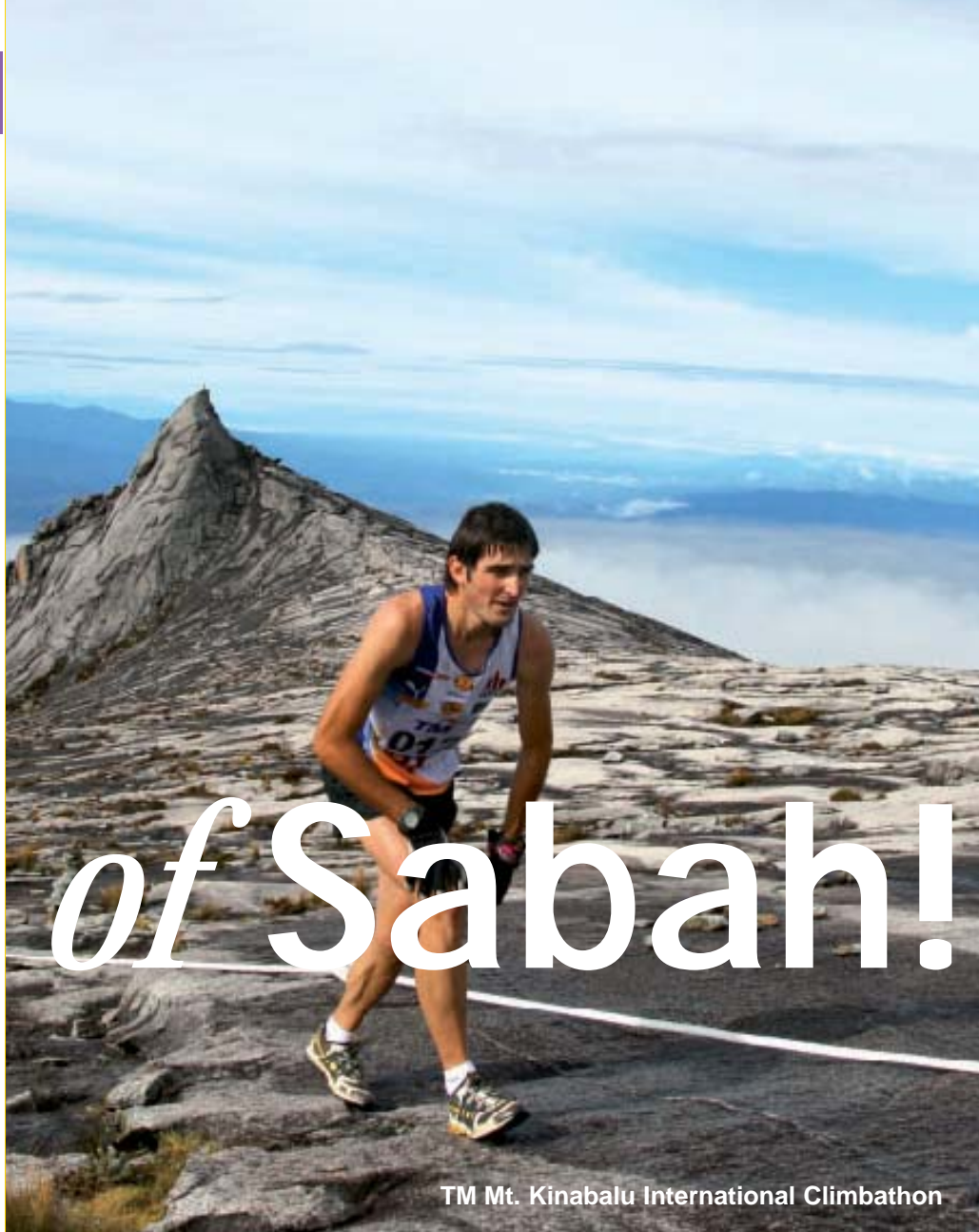
TM Mt. Kinabalu International Climbathon