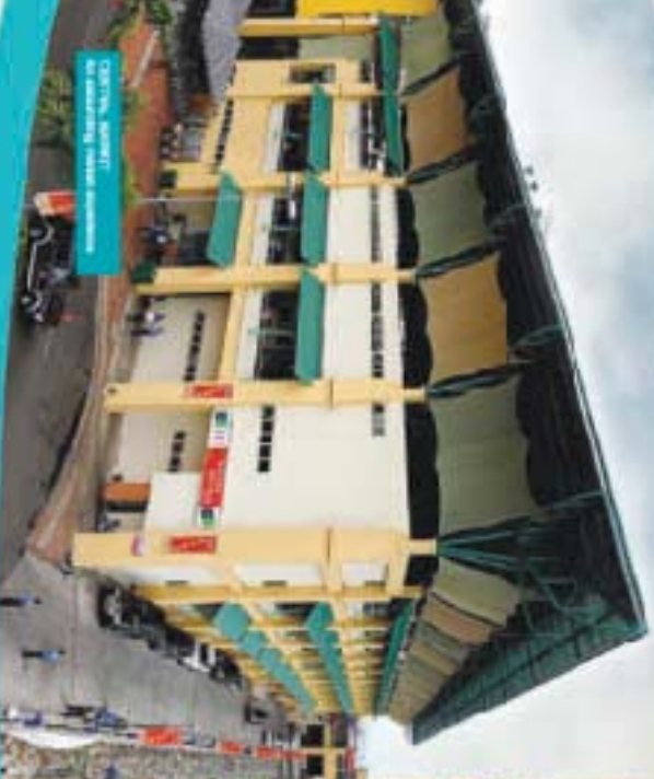
CITY'S SECRET Discovering Sabah's hidden gem

Sandakan is Sabah's hidden jewel, tucked on the beautiful northern coast. Frothing out with nature Sandakan hides the most beautiful view in Sabah. A beautiful landscape, superb cuisine, a heavy atmosphere, squares and Sabah's best dining, shopping and nightlife are happening right now at Sandakan Harbour Square.