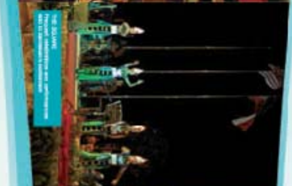
THE SQUARE The heart of Sandakan's new district