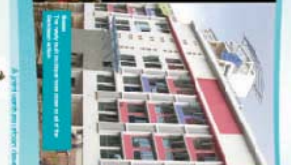
THE SQUARE The heart of Sandakan's new district