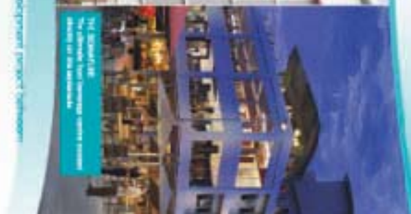
THE SQUARE The heart of Sandakan's new district