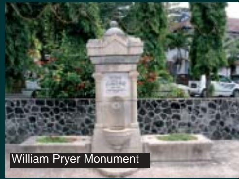
William Pryer Monument