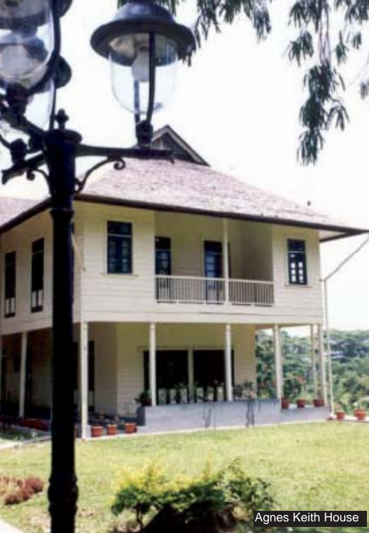
Agnes Keith House