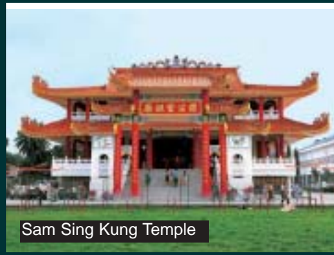
Sam Sing Kung Temple