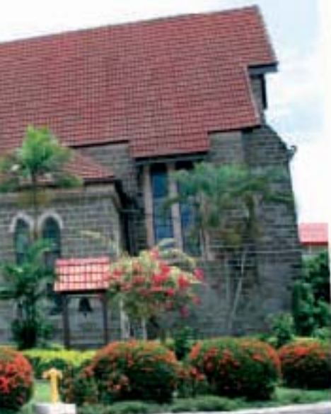
...e major damage during