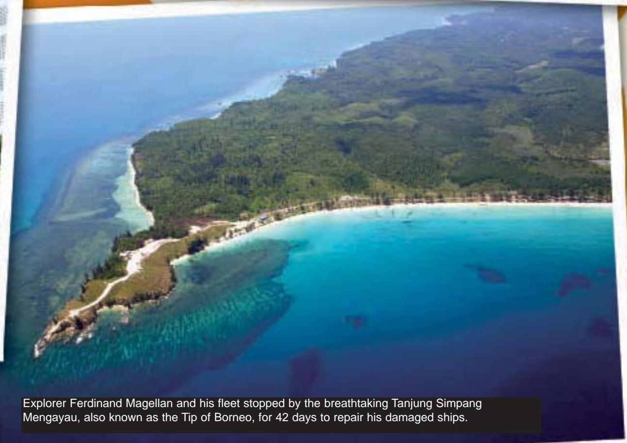
Explorer Ferdinand Magellan and his fleet stopped by the breathtaking Tanjung Simpang Mengayau, also known as the Tip of Borneo, for 42 days to repair his damaged ships.