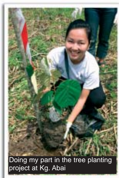
Doing my part in the tree planting project at Kg. Abai

As I flip another page on my calendar, it's hard to believe we're reaching the end of the year. But that hardly means it's time to slow down! November promises a range of exciting events, many of which are uniquely Sabah. Head to Kota Marudu for the Pesta Jagung or Maize Fest, or nearer to Kota Kinabalu city is Tamparuli where you can catch the Bamboo Music Festival. November also marks a special time for the Sabah tourism industry as we celebrate and honour outstanding contributors during the Sabah Tourism Awards (limited tickets are available for purchase). It's all about glam, glitz and glory! Check out the Calendar of Events on page 2 for a complete list of what's happening in Sabah this month.