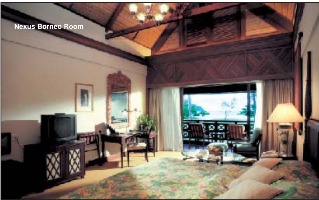
Nexus Borneo Room