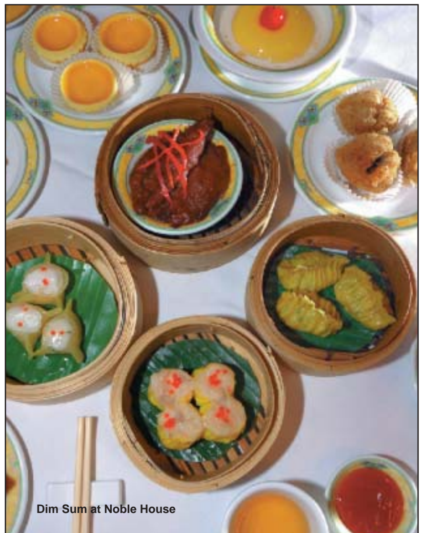
Dim Sum at Noble House

From work to leisure, Nexus Resort Karambunai has it all, so I'm going back there in January of the New Year with my husband who will be flying in from Sydney (as he works there) and my son for a break to recharge our batteries. Nexus...see you again soon.