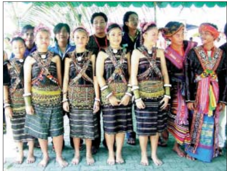
By ANNA VIVIENNE

If you are guiding tourists on these two days, bring them to Sumangkap; you will really make their day.