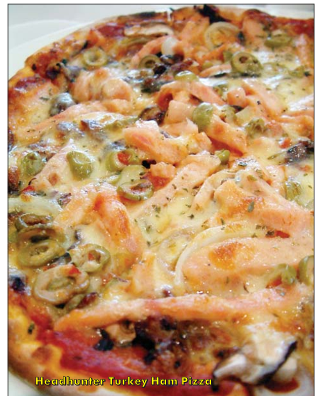
Headhunter Turkey Ham Pizza