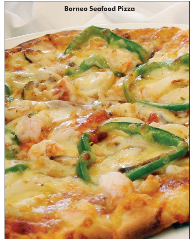
Borneo Seafood Pizza