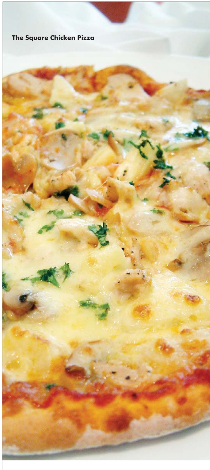
The Square Chicken Pizza

For more information and reservations, call 088-529888, email fboffice@novotel1borneo.com , or visit www.novotelkotakinabalu1borneo.com .