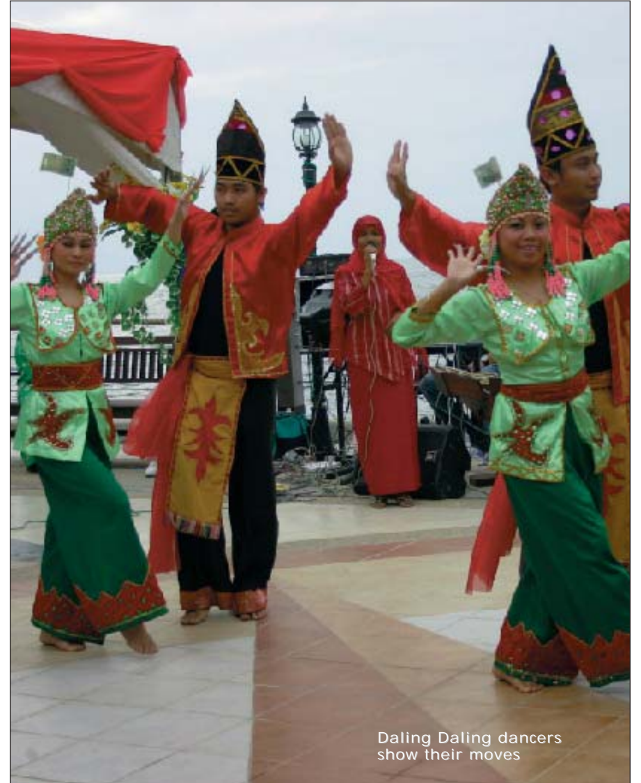
Daling Daling dancers show their moves