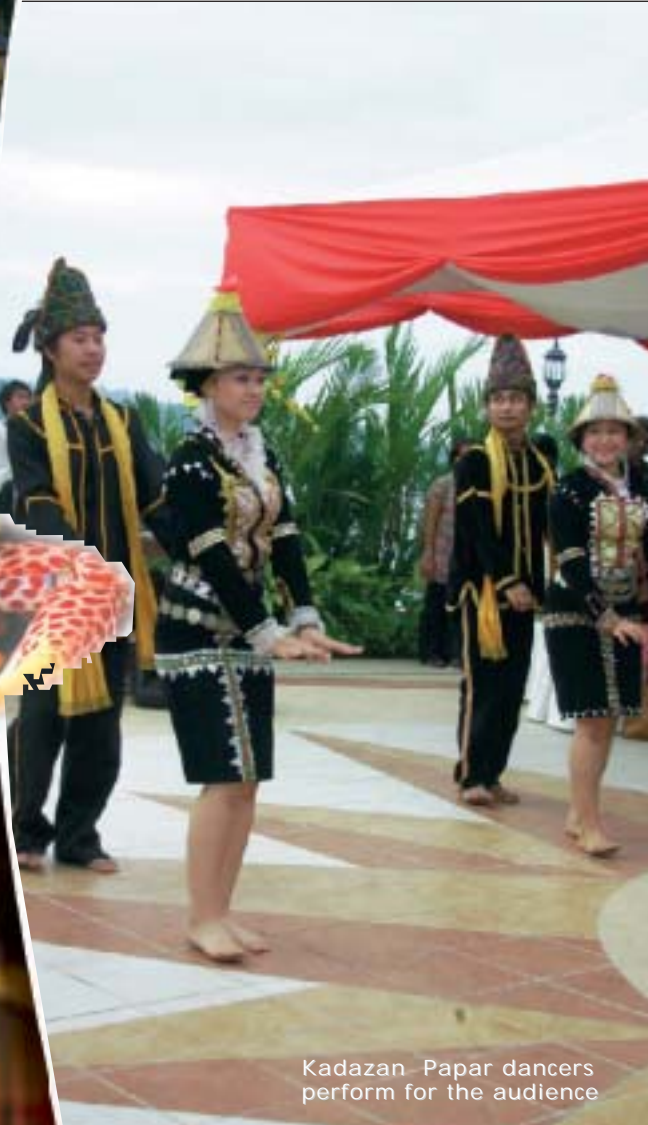
Kadazan Papar dancers perform for the audience

Make sure you grab a copy of INSITES TRAVEL & LEISURE GUIDE every Tuesday, Thursday and Saturday