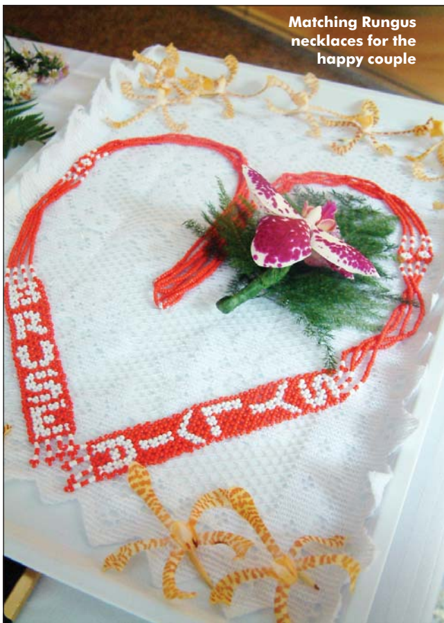
Matching Rungus necklaces for the happy couple