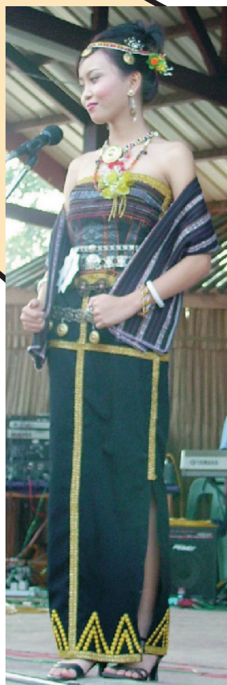
Another Rungus influenced creation