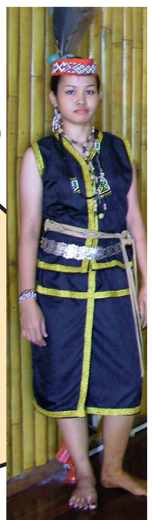
A Lotud influenced dress