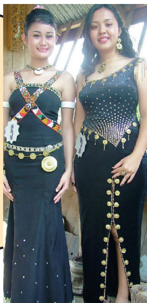
Black gowns with gong sequins