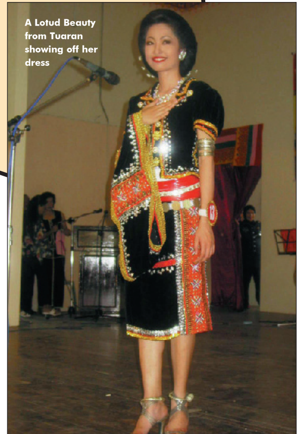
A Lotud Beauty from Tuaran showing off her dress