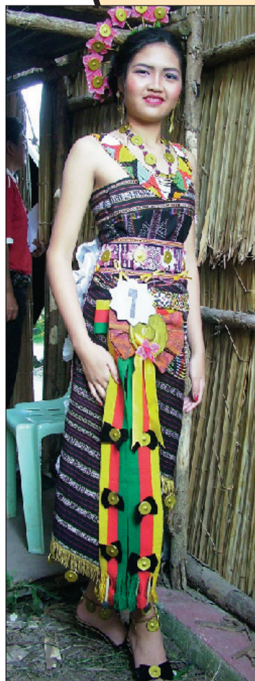
Rungus inspired dress with little gongs for decorations

For advertising enquiries, Call 088-230055 (New Sabah Times) 019-840 2911 (William- Sabah Travel)