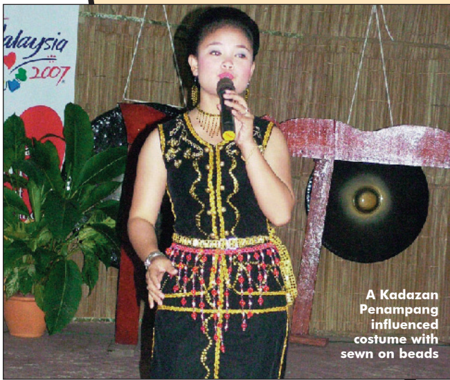
A Kadazan Penampang influenced costume with sewn on beads