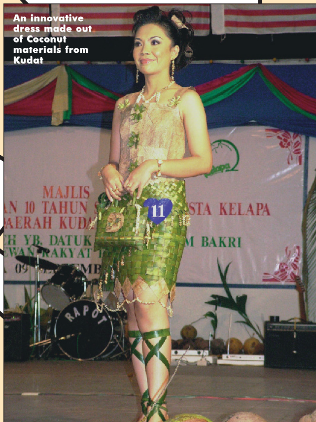
An innovative dress made out of Coconut materials from Kudat