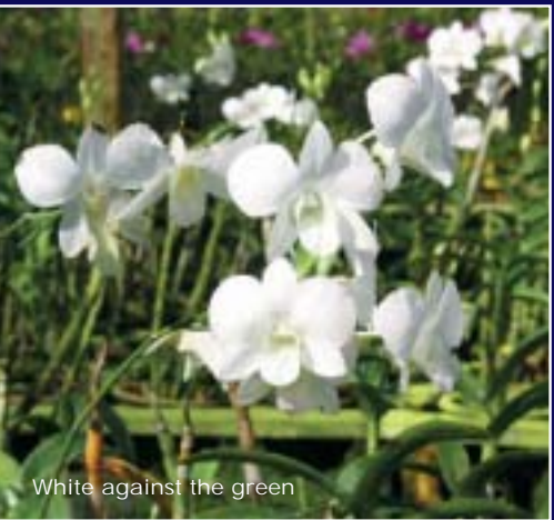
White against the green