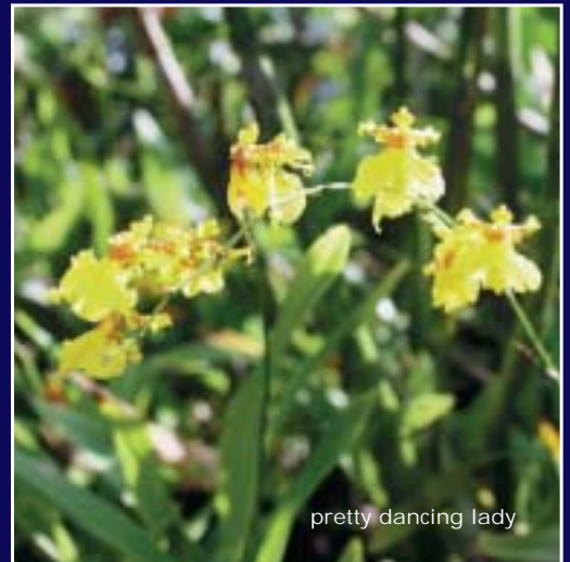
pretty dancing lady