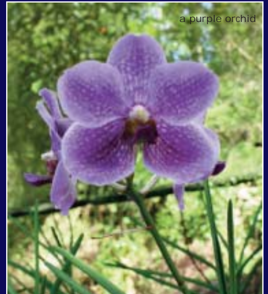
a purple orchid

K AMPUNG Kawakaan, Inanam some 20 kilometres from Kota Kinabalu, the State Capital of Sabah is just a village located on a valley. Like any tropical village, it boasts shady forests, shrubs and plants of various types. Food plants such as tapioca, various types of fruit trees and flowers fringe the dirt road that meanders through the village. The houses stand facing the flat areas of rice fields and vegetable patches, where some villagers can be seen tending to them.