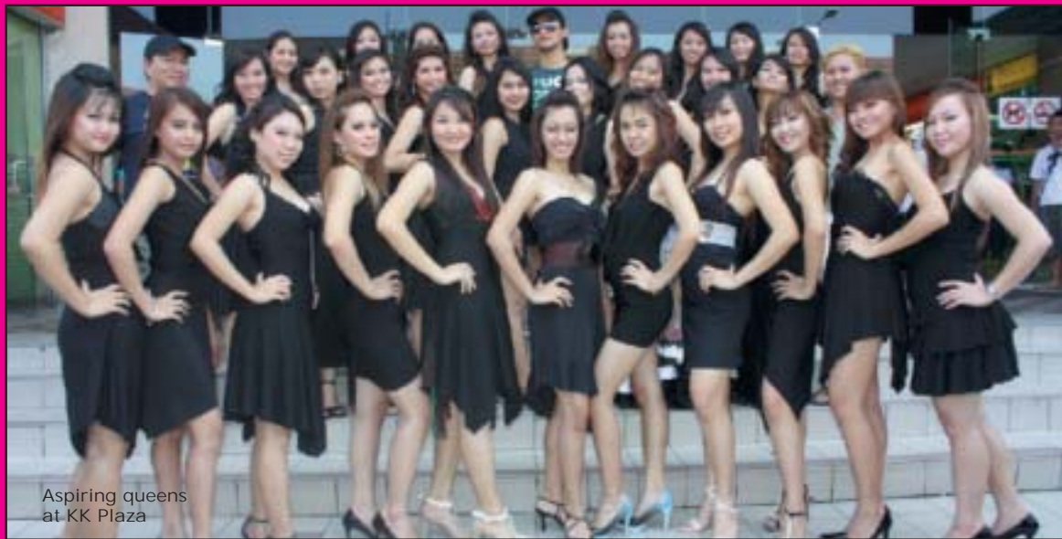
Aspiring queens at KK Plaza

The pageant will culminate on Apr 11, where 15 short listed par-