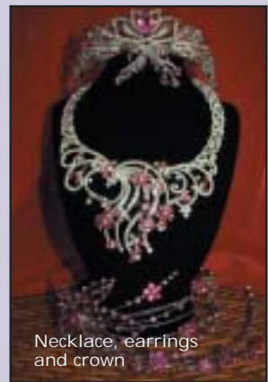
Necklace, earrings and crown