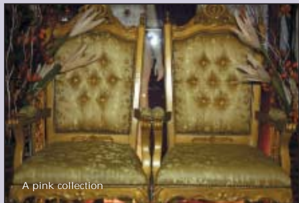
A pink collection