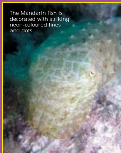
The Mandarin fish is decorated with striking neon-coloured lines and dots