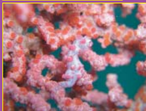
A Blue-spotted ribbontail ray, clearly identified by its bright blue spots, is often seen in shallow sandy areas in search of food.