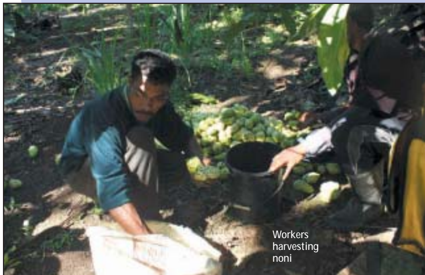
Workers harvesting noni