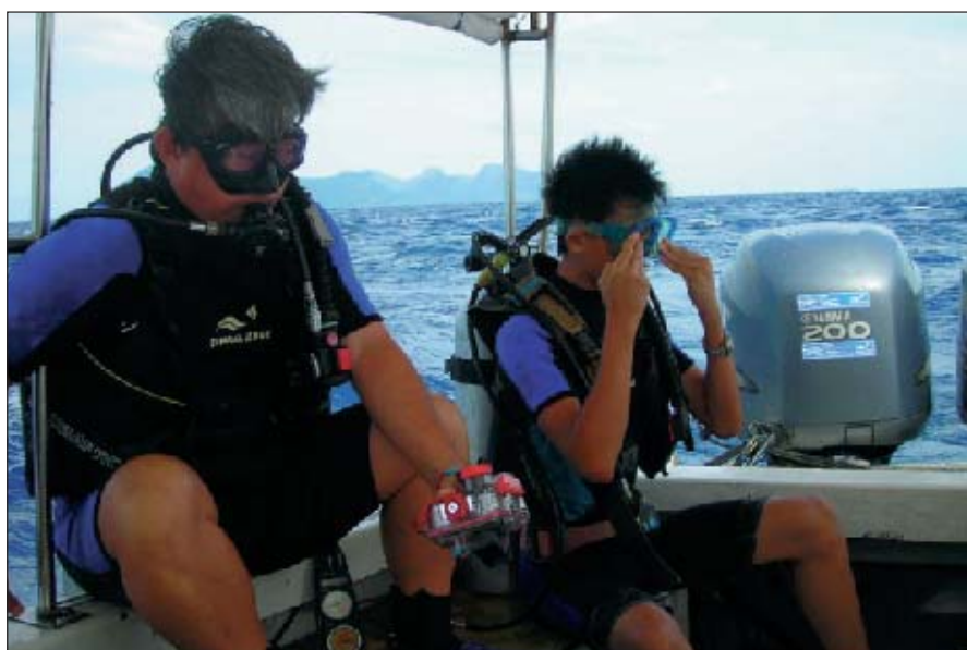
Divers getting ready to explore the underwater world of Pom-pom Island