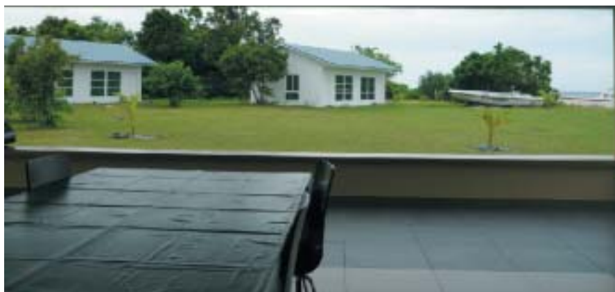
Peace and tranquility on the island