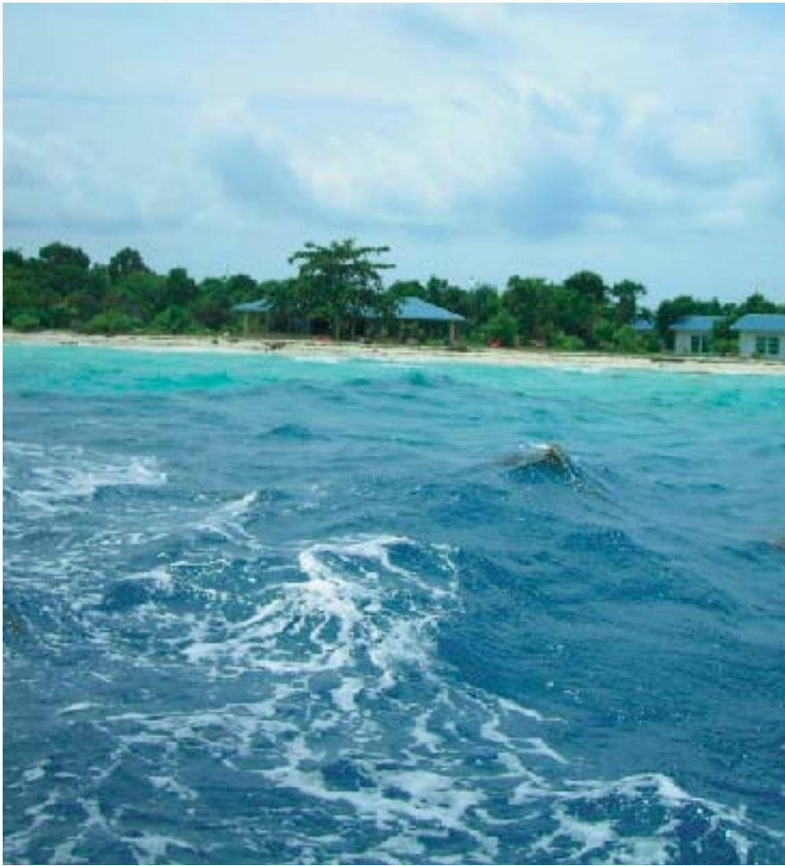
Breathtaking view of the resort from the sea